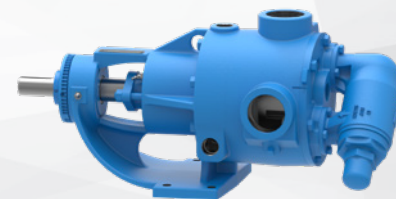
4724 Series™ Pump Shown